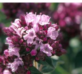
Wild Marjoram Origanum vulgare