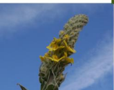
Mullein Verbascum thapsus