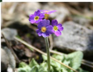
Scottish Primrose Primula scotica