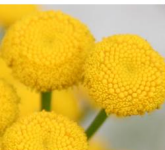
Tansy Tanacetum vulgare