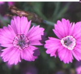
Maiden Pink Dianthus deltoides