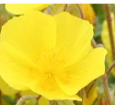
Rock Rose Helianthemum nummularium