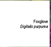
Foxglove Digitalis purpurea