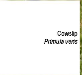
Crowslip Primula veris