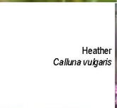
Heather Calluna vulgaris