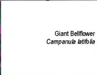
Giant Bellflower Campanula latifolia