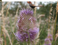
Teasel Dipsacus fulborum