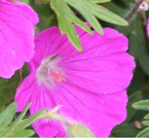
Bloody Cranesbill Geranium sanguineum