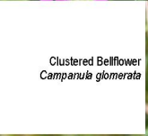
Clustered Bellflower Campanula glomerata