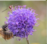
Devil's-bit Scabious Succisa pratensis