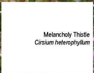
Melancholy Thistle Cirsium heterophyllum