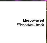
Meadowsweet Filipendula ulmaria