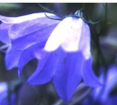
Scottish Bluebell (Harebell) Campanula rotundifolia