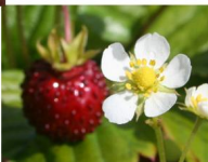
Wild Strawberry Fragaria vesca