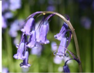
Bluebell Hyacinthoides non-scripta