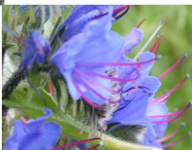
Vipers Bugloss Echium vulgare