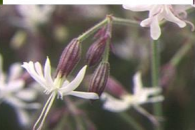
Nottingham Catchfly Silene nutans