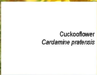
Cuckooflower Cardamine pratensis