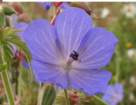
Meadow Cranesbill Geranium pratense