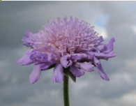
Field Scabious Knautia arvensis