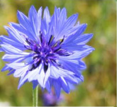
Cornflower Centaurea cyanus