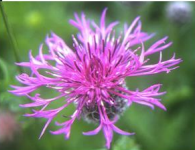
Greater Knapweed Centaurea scabiosa