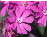
Red Campion Silene dioica