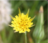
Goatsbeard Tragopogon pratensis