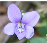
Violet Viola riviniana