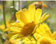
Corn Marigold Glebionis segetum