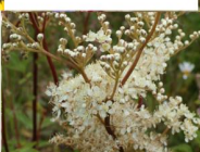
Meadowsweet Filipendula ulmaria