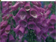
Foxglove Digitalis purpurea