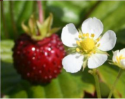
Wild Strawberry Fragaria vesca