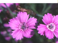
Maiden Pink Dianthus deltoides