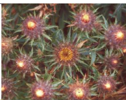
Carline Thistle Carlina vulgaris NEW FOR 2013