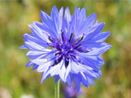
Cornflower Centaurea cyanus