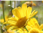
Corn Marigold Glebionis segetum