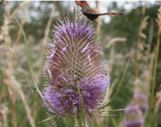
Teasel Dipsacus fullonum