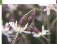
Nottingham Catchfly Silene nutans