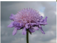
Field Scabious Knautia avensis