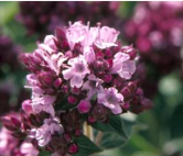
Wild Marjoram Origanum vulgare