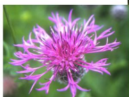
Greater Knapweed Centaurea scabiosa