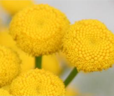
Tansy Tanacetum vulgare