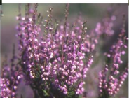
Heather Calluna vulgaris