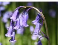
Bluebell Hyacinthoides non-scripta