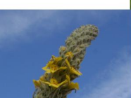
Mullein Verbascum thapsus