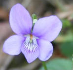
Violet Viola riviniana