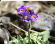
Scottish Primrose Primula scotica