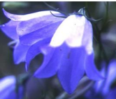
Scottish Bluebell (Harebell) Campanula rotundifolia