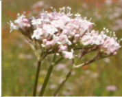
Valerian Valeriana officinalis NEW FOR 2013